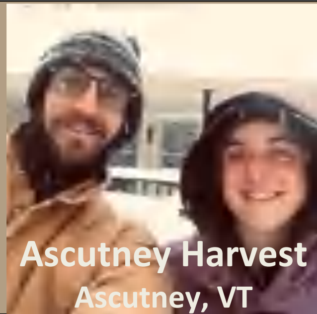
Ascutney Harvest Ascutney, VT