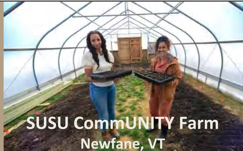
SUSU CommUNITY Farm Newfane, VT