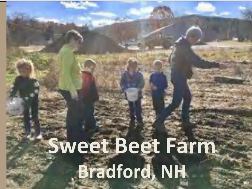
Sweet Beet Farm Bradford, NH