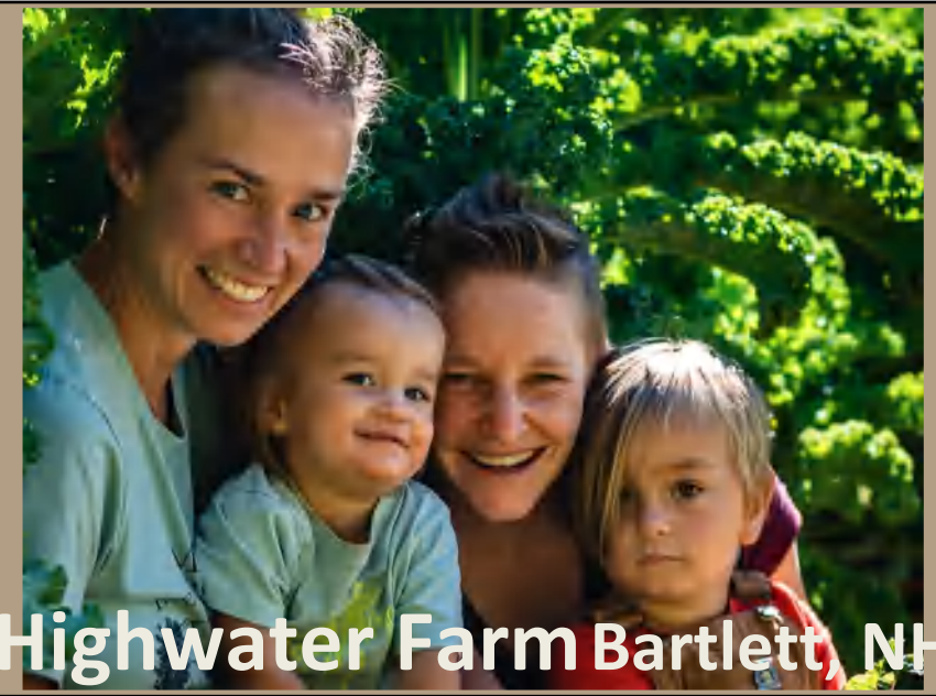
Highwater Farm Bartlett, NH