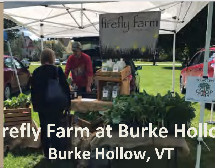
Firefly Farm at Burke Hollow Burke Hollow, VT