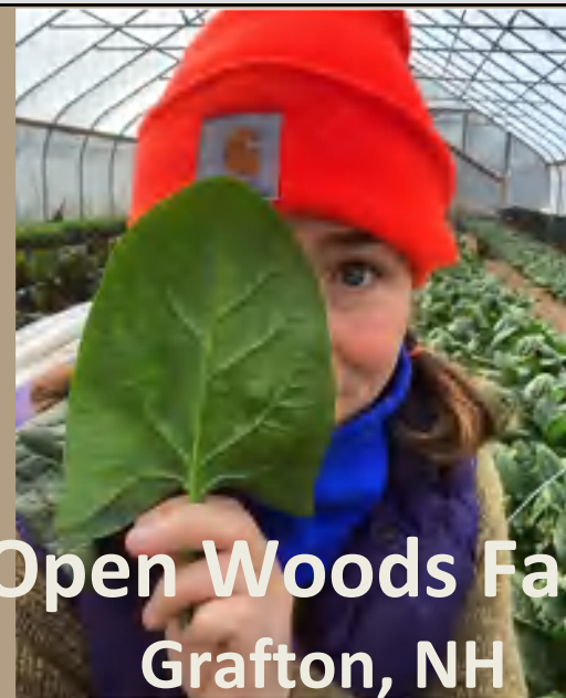
Open Woods Farm Grafton, NH