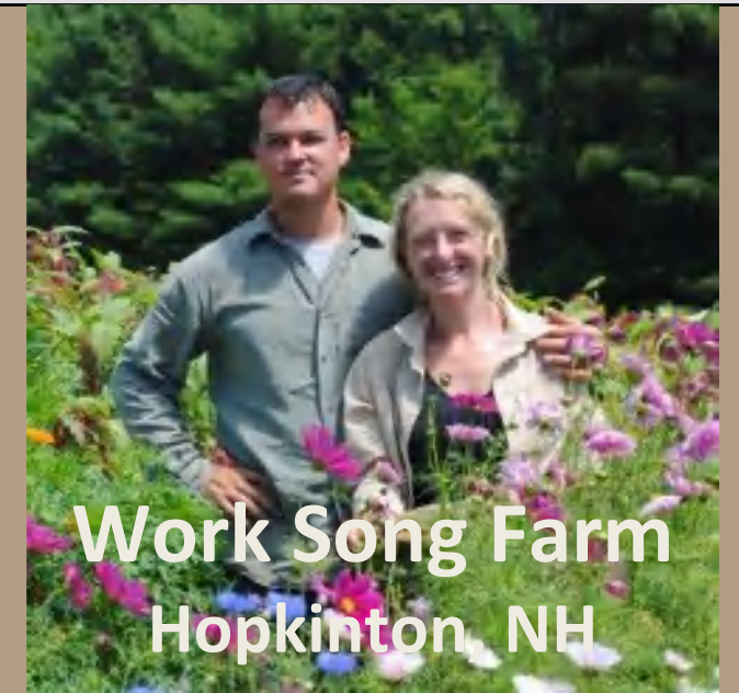
Work Song Farm Hopkinton, NH