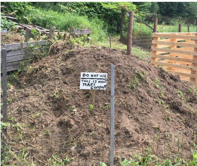
Ludlow Area Community Garden and Compost, Ludlow, VT

Piles require careful construction, regular turning, and consistent temperature monitoring. This type of system, especially larger ones, will likely require more volunteer assistance for turning and maintenance.