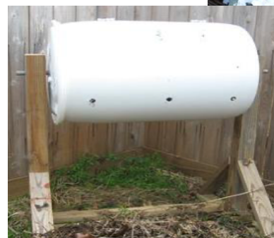
Examples of compost tumblers. Top: 2-chamber Hot Frog; middle: insulated 2-chamber Jora; Bottom: DIY tumbler