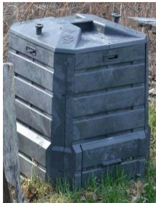
Plastic "Soil Saver" Compost Bin

Plastic bins can have challenges with sufficient airflow, causing the material to become too wet (anaerobic), which can lead to strong odors. If using this type of bin, be sure the compost recipe contains enough browns to absorb excess moisture.