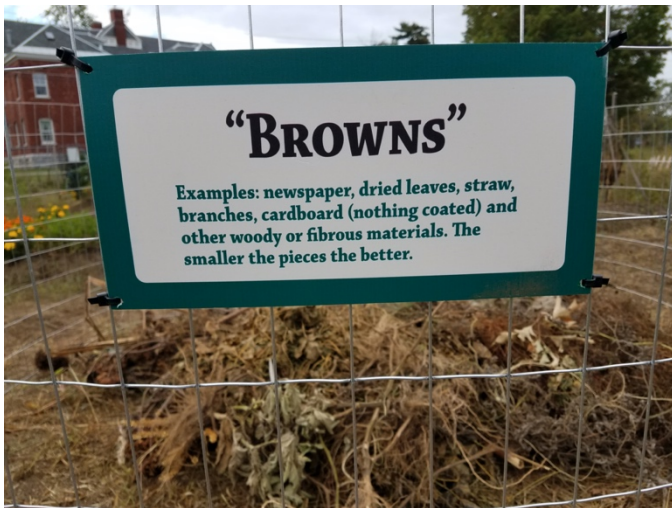
Fort Ethan Allen Community Garden and Compost, Colchester, VT

Wire bins , often made from chicken wire, are best for storing carbon sources (leaves, yard trimmings, garden trimmings, etc.). Wire bins are not recommended for composting food scraps because they are not fully enclosed and can attract wildlife.