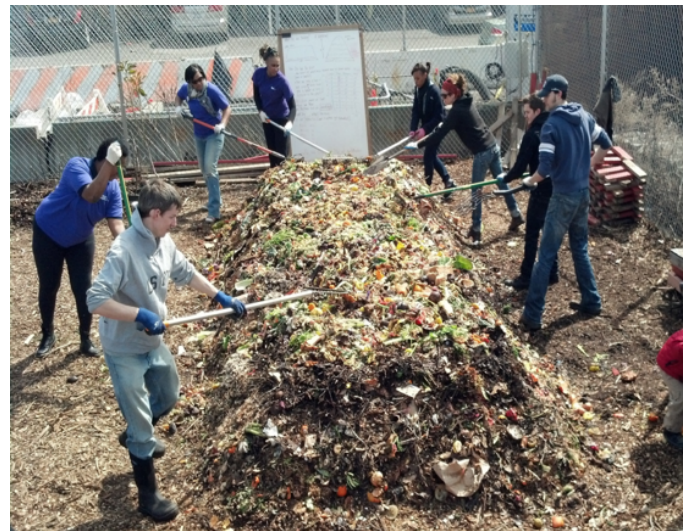
GETTING PHOTO INFORMATION...

Windrows are managed similarly to piles. Windrows can compost a much larger quantity of food scraps than piles or bins, but they require a lot of dedicated manual labor to maintain.