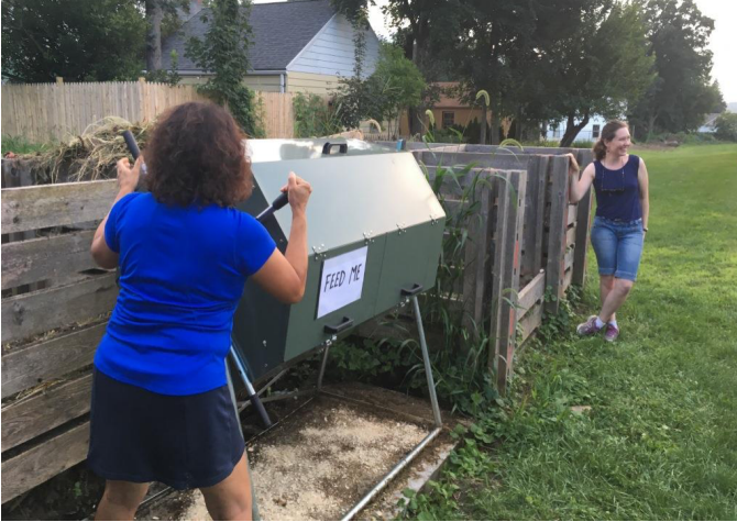
Photo Cr.: Athena Lee Bradley, Bennington Community Compost Site, Bennington, VT

Sites which combine systems with a mix of tumblers, bins, and/or piles can be an effective way of maximizing the volume of organic material that can be processed on a small footprint.